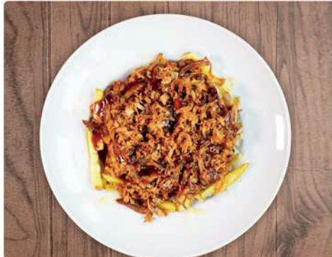
7. POTATOES RDC: 12.50€