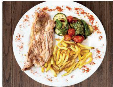
4. FLANK STEAK 15€