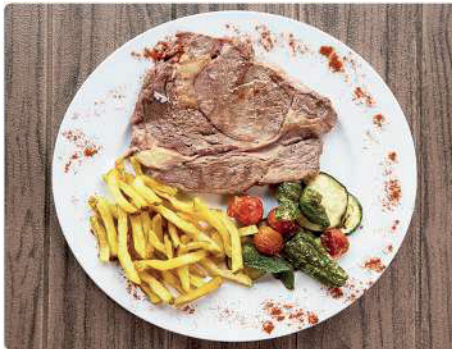
5. BEEF ENTRECOTE 18€