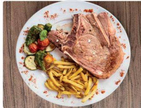
6. RIBEYE STEAK 400/500g ..... 19€ 700/800g ..... 24€