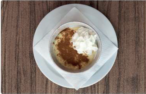
1. TIRAMISU: 4.00€