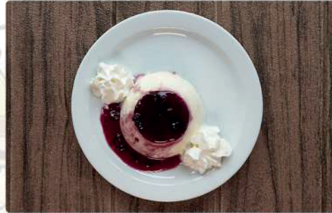
2. PANNA COTTA: 3.50€