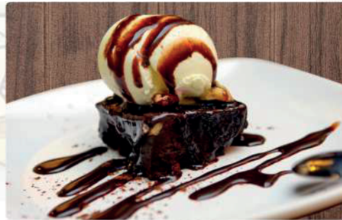
5. BROWNIE CON HELADO: 5.50€