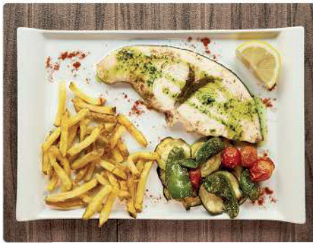
1. EMPEROR 17€