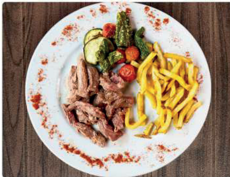
3. FLANK STEAK 16€