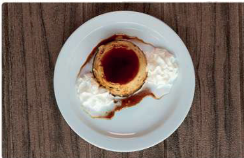
4. FLAN DE HUEVO: 3.50€