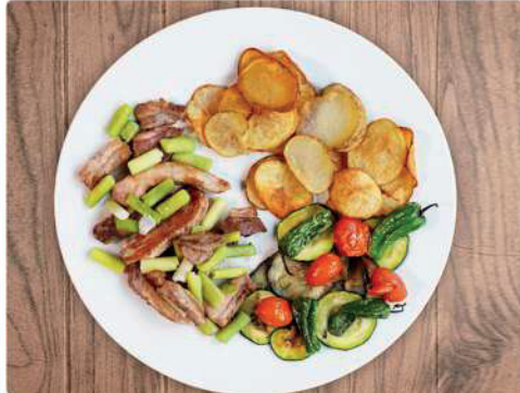
8. IBERIAN SECRET: 15€