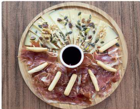
9. IBERIAN CEBO AND MANCHEGO CHEESE PLATTER 18€