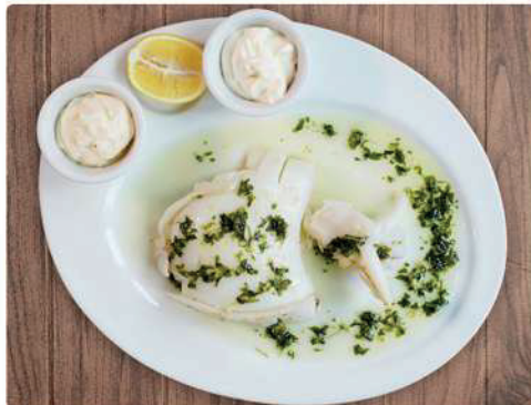
10. CUTTLEFISH: 13.50€