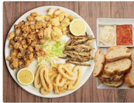
2. MIXED DEEP FRIED FISH 29.50€