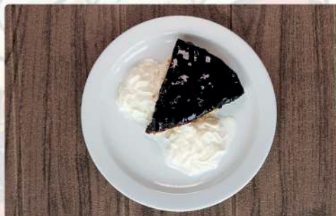
3. CHEESE CAKE WITH CRANBERRIES: 4.50€